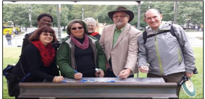
TRU staff, board members, and founders signed a section of ceremonial M-1 Rail track.