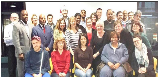
TRU was pleased to participate on the first RTA CAC, with dozens of diverse community leaders and transit supporters from across the region.

Next Up: 2015 and 2016 will be even busier, bringing the region together around a Regional Master Transit Plan that will prioritize transit improvements for the next 20 years. The RTA will soon be fully staffed and ready to start building the broad regional consensus that will be needed to pass regional transit funding in 2016.