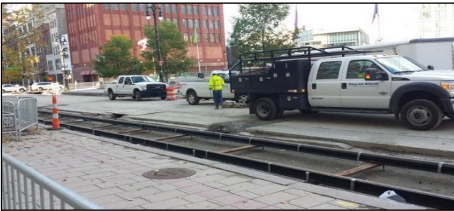
While M-1 Rail construction causes some short-term headaches, it will provide great long-term benefits.